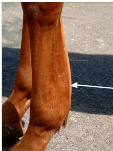
A 'bowed' tendon (arrowed)