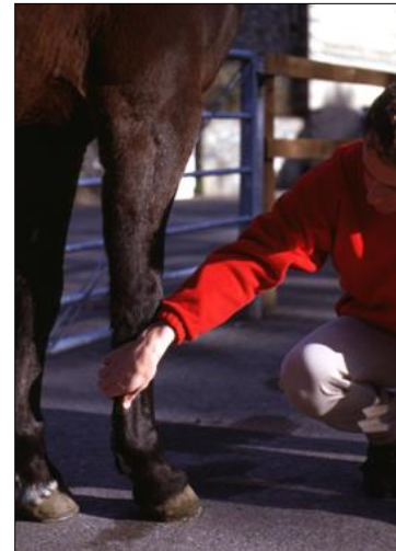
Veterinarian examining a horse's tendon for signs of injury.

The flexor tendons (deep digital flexor tendon, DDFT, and superficial digital flexor tendon, SDFT) run down the back of the leg from the level of the knee (or hock). The SDFT ends on the pastern, the DDFT ends on the lower surface of the pedal bone. At the back of the knee, in the region of the hock and at the level of the fetlock and upper pastern, the tendons are enveloped by a fluid filled sheath. Several strong, short, annular ligaments help to keep the tendons in place in areas of high movement such as joints.